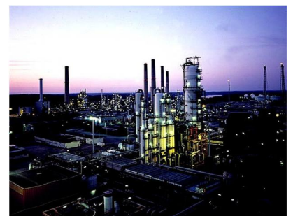
Fig. 3 Porvoo Refinery, Finland