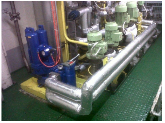
Bollfilter UK Limited

Unit 9 Station Road UK-Tolleshunt D'arcy, Essex CM9 8TY Tel.: +44(0)1621 862180 Fax: +44/(0)1621 869257 E-mail: enquiries@bollfilter.co.uk