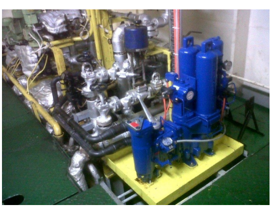
Starboard Bollfilter main engine fuel filter type 6.72.1