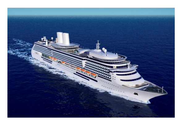
Ocean Going Cruise Liner

System Main Engine Fuel Oil Filtration: 2 x Bollfilter Type 6.72.1 DN65, Filtration: 34 microns Standby Filtration: 37 microns Complete with type 2200 control panel