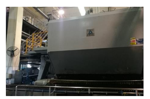
BOLLFILTER installed at GLM2 BWM of Bottle Line 2

When cleaning recycling bottles, a lot of particles, e.g. labels, soiling, cigarette butts, are entering the caustic liquid. As a result the activity of the liquid decreases so that it cannot be used for a long time, its working life is not longer than about 2 weeks. The frequent discharge of caustic liquid from BWM results in a huge amount of waste of caustic liquid, heating energy, water etc. Moreover, it is a big load for the factory's waste water treatment plant. The downtimes resulting from exchanging the caustic liquid also lead to the factory's benefit reduction. Therefore, with higher demand of environment protection, all drinking enterprises are urgently looking for a solution with high benefit to extend the working life of caustic liquid. This is what makes filtration for caustic liquid absolutely necessary.