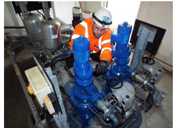
2 x BOLLFILTER Type 6.18 DN150 Odour Control Filters

System 2 x BOLLFILTER Automatic Type 6.18 DN50 Filtration Level: 100 micron Flow Rate: 38 m3/hr Operating Pressure: 3 bar