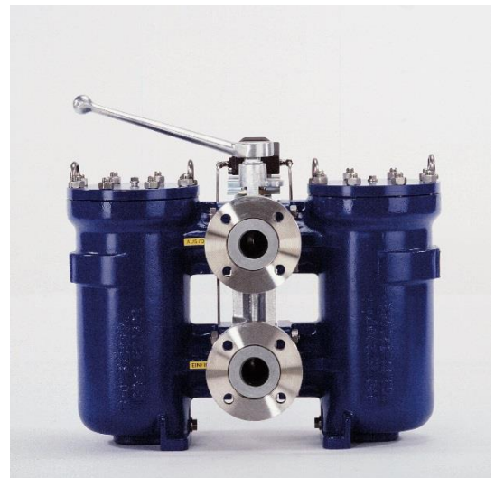
Duplex manual filters protect sugar syrups and condensates from contamination in the event of factory breakdown.